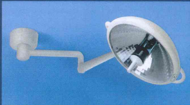
S2 Pictured - S1 or S2 Models Available

The Solo can consist of either an S2 surgery light or S1 surgery satellite. With the continuous rotation of all critical pivot points, along with the extensive arm coverage, the Solo provides the ideal single surgery light.