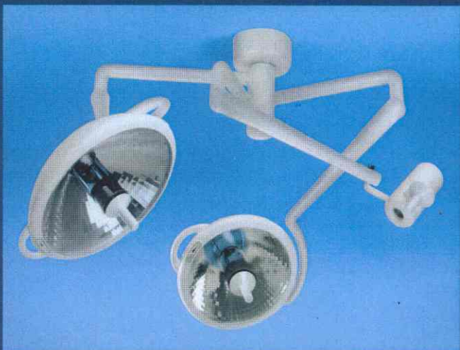
S2 and S1 and P1 Pictured - Any Combination of S1, S2 or P1 Lights Are Available

With the Trio mountings, virtually any of SYSTEM ONE models can be combined to create a truly dynamic surgery lighting system. The Trio also increases the surgery suite capabilities by allowing for two surgery lights and a video camera, all in the same mounting.